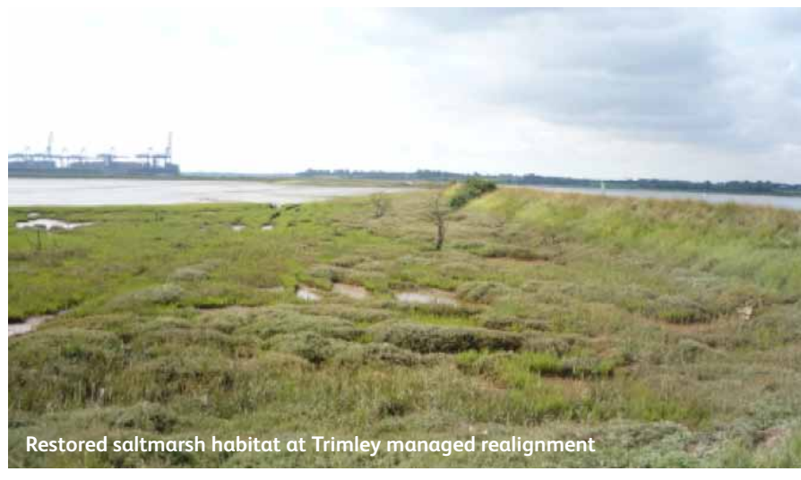
All images © Royal HaskoningDHV copyright and database rights 2013